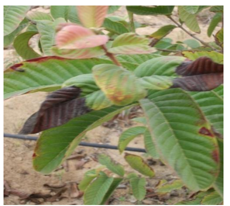
Fig. 1. Symptoms on the leaves , which turned into brown then to dark brown color.

powdery mildew like spots on the lower leaf surface . Microscopic examination showed acervulus covered with spores of multi cells and spindle shape. Later the diseased spots turn into brown color and expanded , especially from the leaf margins and covered most of the leaf surface and turned into dark brown. At later stage the infected leaves become dry and defoliated (Figs. 1 and 2).