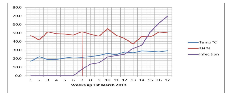
Fig. 6. Weekly mean temperature, relative humidity and diseases severity measured and calculated for seventeen weeks up first March to end of June 2013.

During March of 2009 uncommon leaf spots was noticed on scattered trees in an guava orchard (35 feddan) in El-Sadat district, Menofeia governorate, Egypt. At the last decade, guava trees in different other orchards were heavily infected with the same leaf spot disease, which resulted in deterioration of many orchards. Diseased leaves showed powdery mildew like spots on the lower leave surface specially on leaf margins; microscopically examination showed acervuli covered with multi cells spindle shape spores, later the disease spots turn into brown color expand specially from the leave margins and cover most of the leave surface and turn into dark brown. At the later stage the infected leaves fall. These symptoms are in accordance with that described by Cloutrer (1975) on Chinese Junipers, Keith,et al. (2006 a and b) on guava and tea trees and Chliveh, et al. (2014) on olive trees.