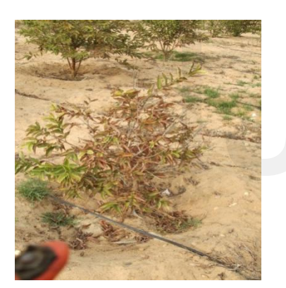
Fig. 2. Dead and defoliated leaves as the result of the later stage of the infected.

Fig. 1. Symptoms on the leaves , which turned into brown then to dark brown color.