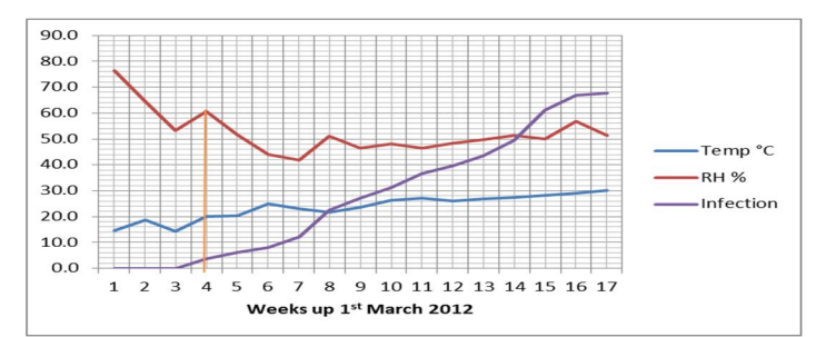
Fig. 5. Weekly mean temperature, relative humidity and diseases severity measured and calculated for seventeen weeks up first March to end of June 2012.